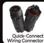
Quick-Connect Wiring Connector

The COMMODORE 3.0 GPM water pump is specifically manufactured to be as versatile as possible. This one pump can be used for multiple applications, including Fresh Water Supply to Sinks and Showers, Fresh Water Washdown, Raw Water Washdown and other water transfer applications. This self-priming pump is also run dry safe and salt water safe. With 3 gallons of flow, this pump can supply up to 3 fixtures at the same time. COMMODORE'S specially designed low-noise motor, paired with its completely rubber mounting base, make this pump run extremely quiet compared to competing brands. It's industry standard mounting base and fittings allow you to swap out your existing pump with ease.