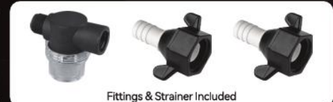
Fittings & Strainer Included