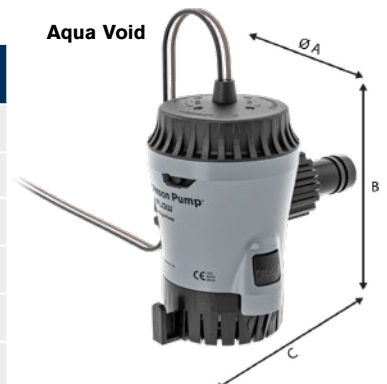
Aqua Void Automatic Ultima Combo