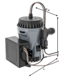
Aqua Void Automatic-Electro-Magnetic Combo