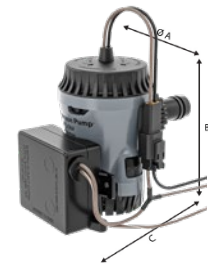
Aqua Void Automatic-Electro-Magnetic Combo