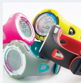
Compact 40mm models