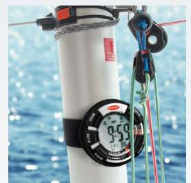
Mast mounting option