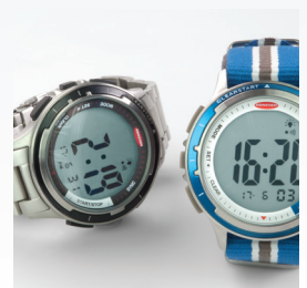
Stylish stainless steel models