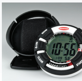
Removable timer unit