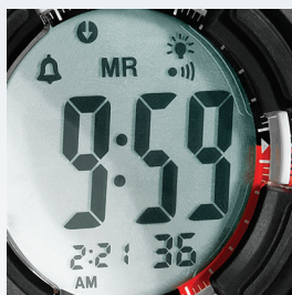
Large quick view displays