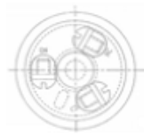
(3 terminal configuration)