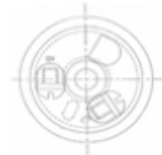
(2 terminal configuration)