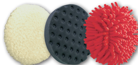
YBP-5103 YBP-5203 YBP-3153