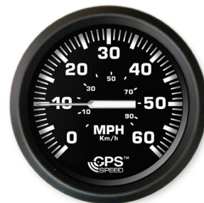
Scale may vary depending on model.

Speed data is shown by an analog pointer. This pointer is driven by a digital stepper motor for increased accuracy and minimized pointer bounce during vessel operation.