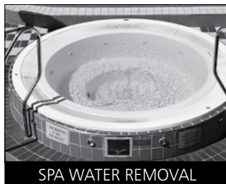
SPA WATER REMOVAL