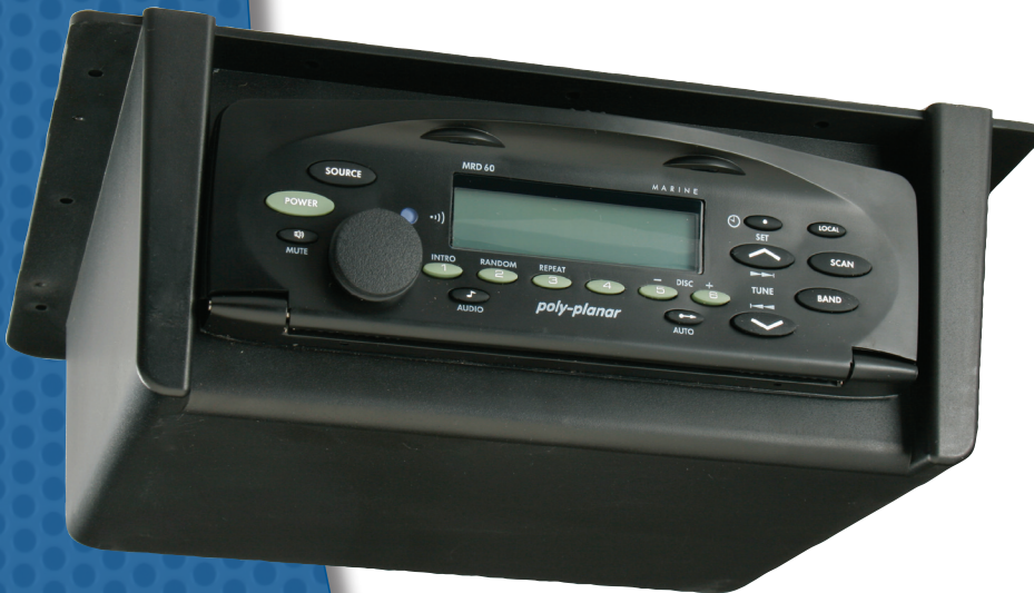
Shown with MRD-60 Stereo (not included)

This rugged enclosure is designed for under dash or overhead mounting. The RM-10 comes with mounting screws and self adhesive gasket tape.