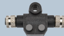
Gender Adaptor Cable Connector (SP4192)

All wires remotes are complete with moulded deck socket Rated to IP67.