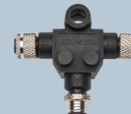
Dual Installation T Connector (SP4155)

* AA341 Model (P102995) is similar to AA342 but can be used as a general dual equipment controller (contact Maxwell for details).