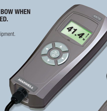
AA730 With Rode Counter (P102994)