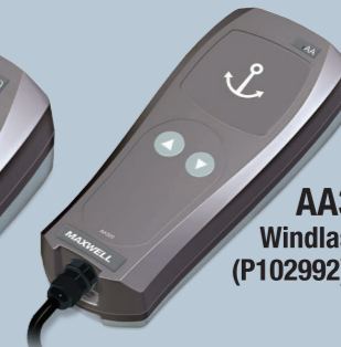
AA320 Windlass Control (P102992)