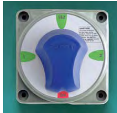
Battery Selector Switch Continuous Amps: 360 Momentary Amps: 600