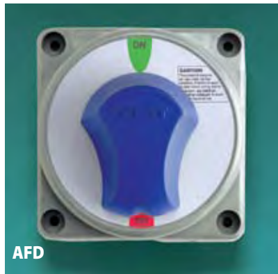
Extra-Duty On/Off Switch Continuous Amps: 600 Momentary Amps: 1000